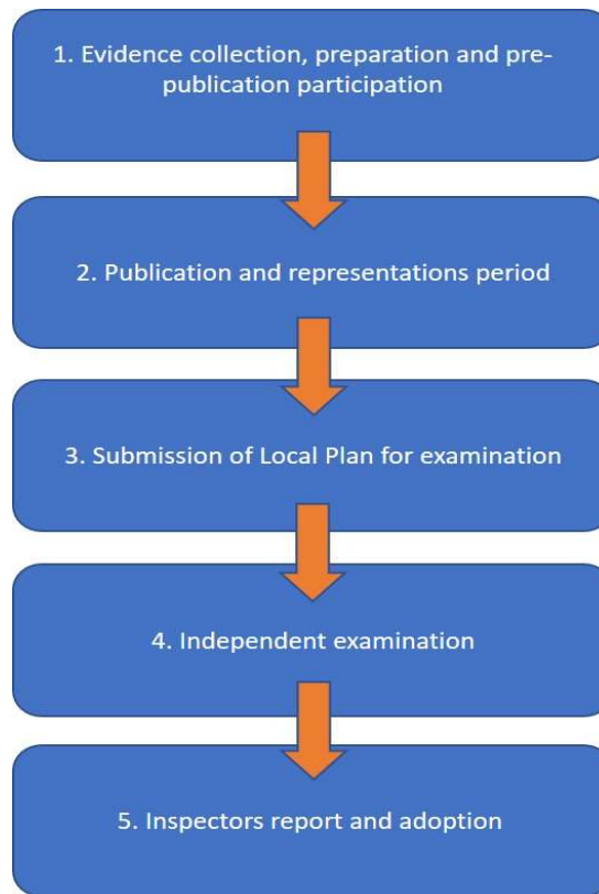
Figure 3: Local plan preparation